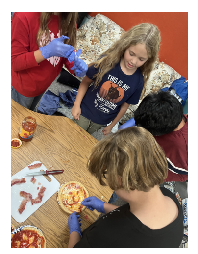
Learning safe food handling and knife skills!